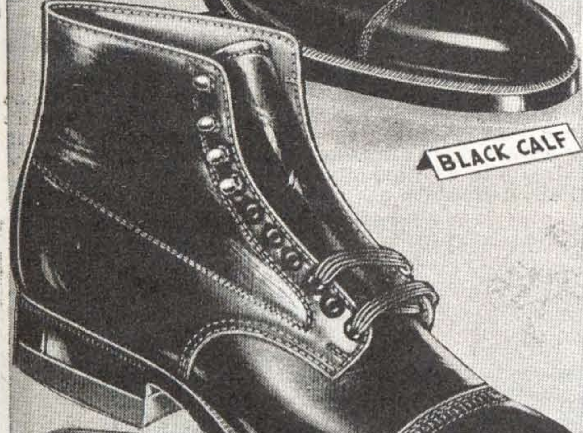
BLACK CALF or KID