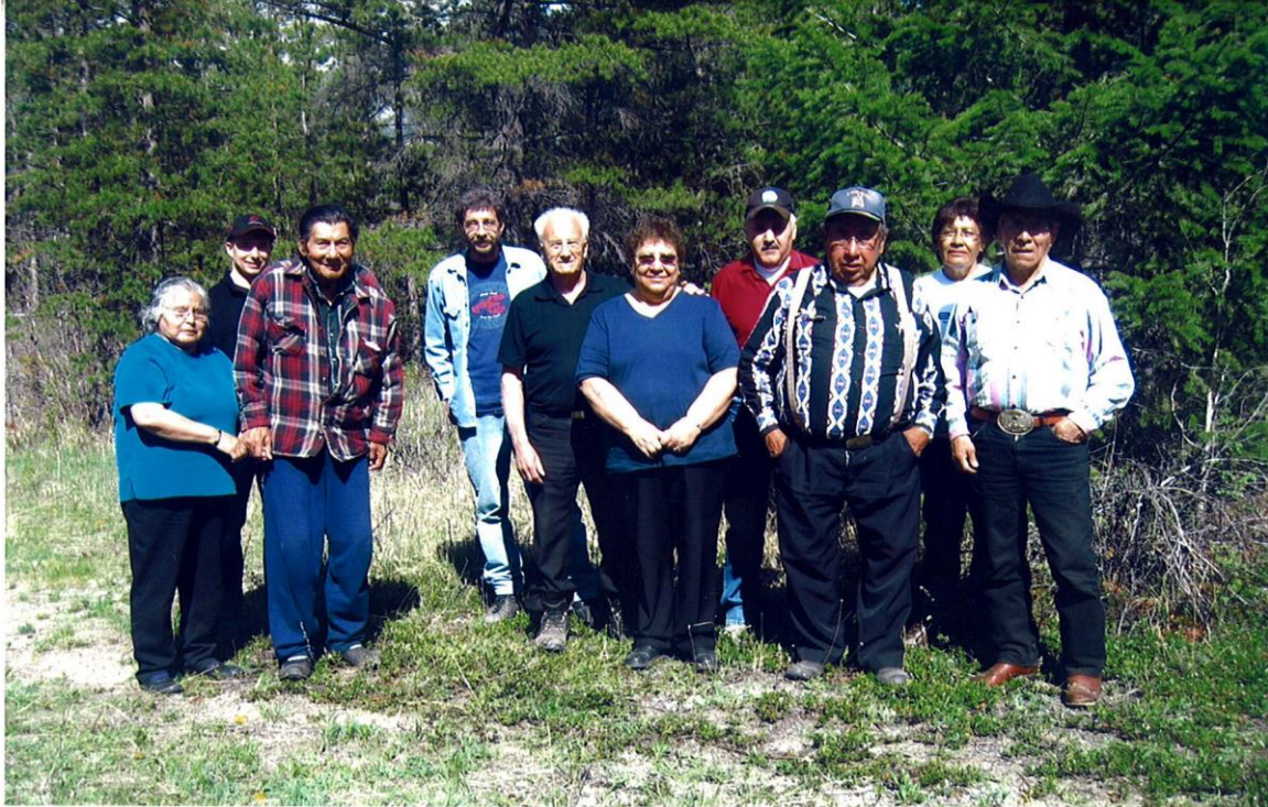
5.2 Representatives from The Council of Elders of Japer Park meeting with representatives from Kinder Morgan, spring 2006