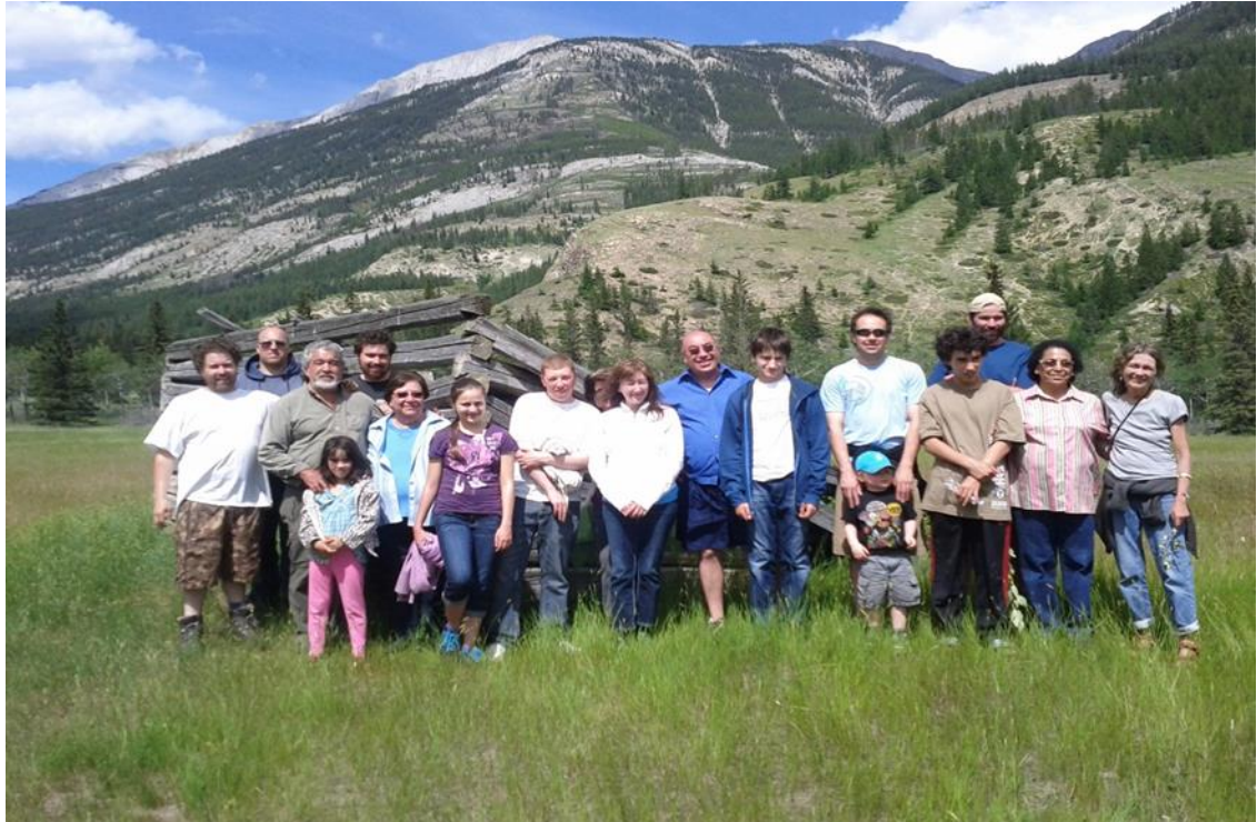
6.3 Visitors and Hosts at the John Moberly Homestead July 15, 2011