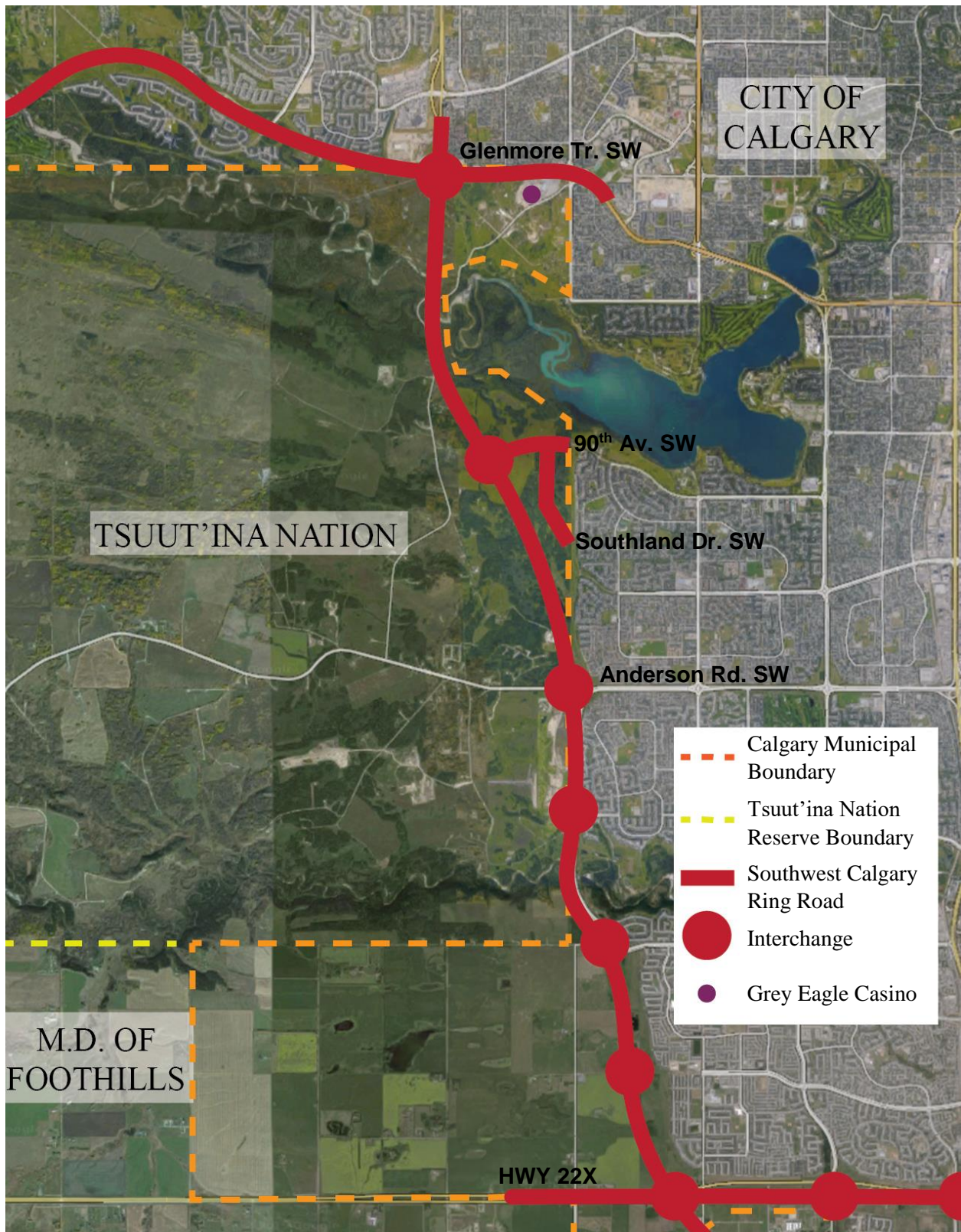
Figure 3. Approximate alignment of the Southwest Calgary ring road (Adapted from Alberta Transportation, n.d.; Google Maps, 2015).