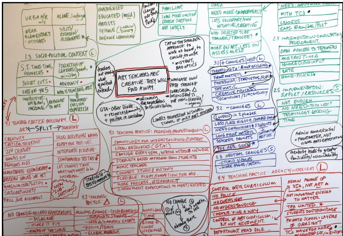
Figure 2. Categorization of key findings process.

This analysis process helped me to see a different picture, as some earlier findings were corroborated, some proved contrary, and others were altogether new. It was difficult for me to see connections between categories however, until I developed a colour-coded system whereby I created a large, visual chart of key findings sorted by category (see Figure 2). It was during this process that I began to see interrelated connections between categories, and new themes emerged.